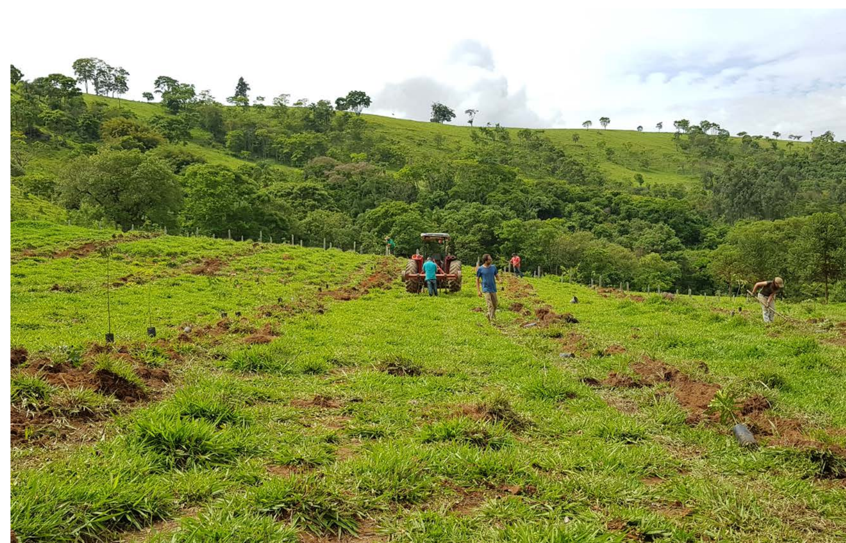
Illustration 2. No-tillage conservative soil management during plantation, only subsoiling along planting lines.

For soil life regeneration, and water and nutrients retention, an ancestral method based on Anthropogenic Dark Earth formation was employed, mainly based on charcoal and sawdust deposition. High nitrogen fixer species were selected for alley green manure. Selection and arrangement of species considered succession, stratification, shade tolerance, treetop architecture, permeability, lifecycle, root depth, nutrition and water need. Agricultural and forestry crops are Macadamia ternifolia , Coffea arabica - Catucaí 2SL (perennial crops) and Toona ciliata (timber), Musa paradisiaca (short-cycle crop), and Inga vera (nitrogen-fixing, biomass-producing service species). A seed-mixture for alley biomass enrichment was composed using Urochloa brizantha , Cajanus cajan , Helianthus annuus , Pennisetum glaucum and Crotalaria spectabilis . Soil management and mulching method was established using a regenerative mix for nutritional fertilizing purposes, charcoal residues and ashes for raising soil CEC, coffee rusks + poultry manure (12% N) and eucalyptus sawdust for soil covering. All attributes of the design were systematized (quantitative and qualitative variables).