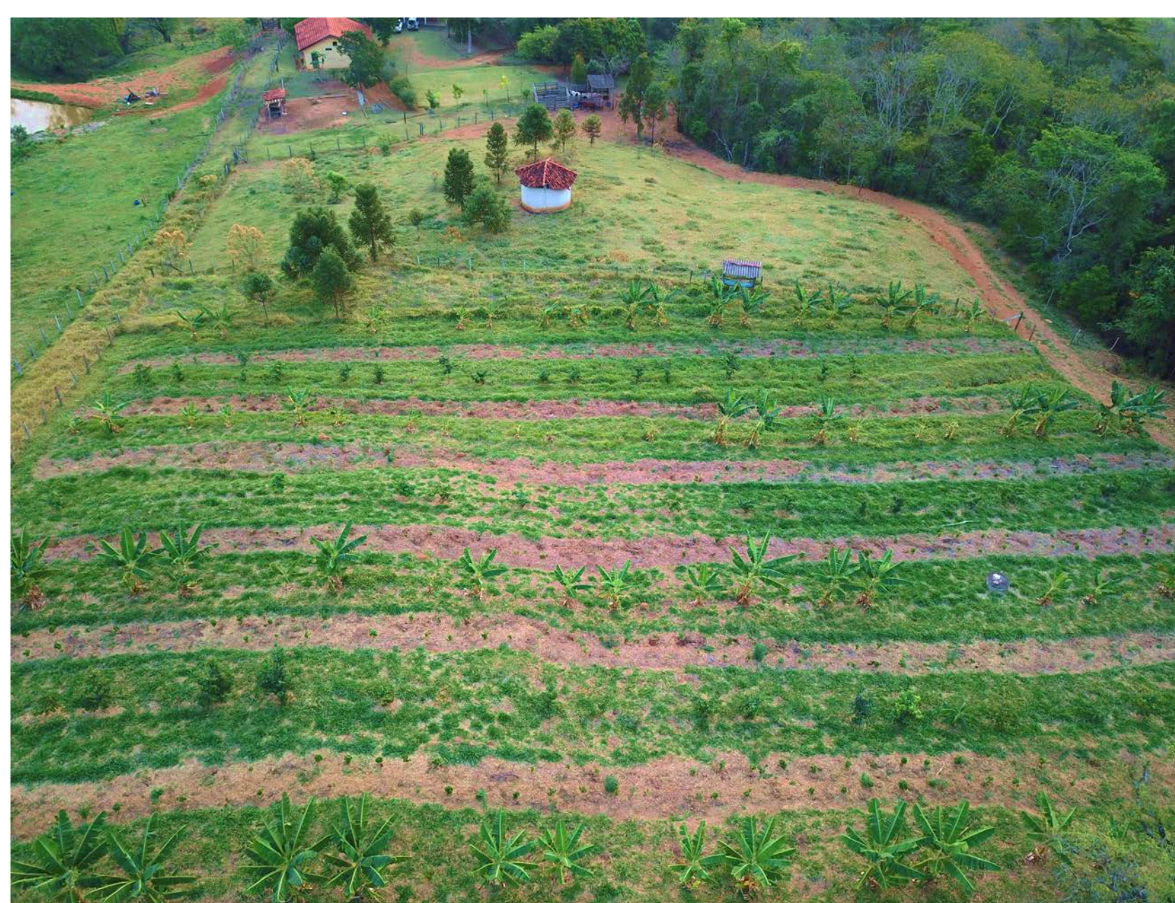
Illustration 4. Coffee Agroforestry implemented after 10 months.